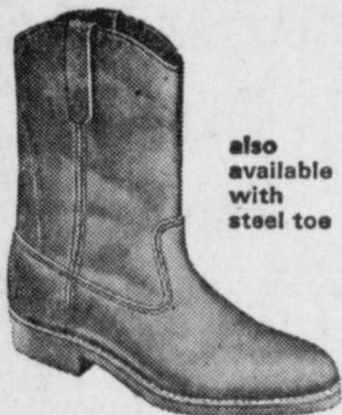
also available with steel toe

Here's a man's boot every step of the way! Rugged, handsome, ready for a rough day's work anytime. Easy on the feet, too. Stop in — try on Pecos by Red Wing and be convinced!