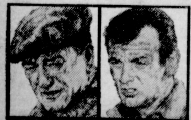
JOHN WAYNE DAVID JANSSEN