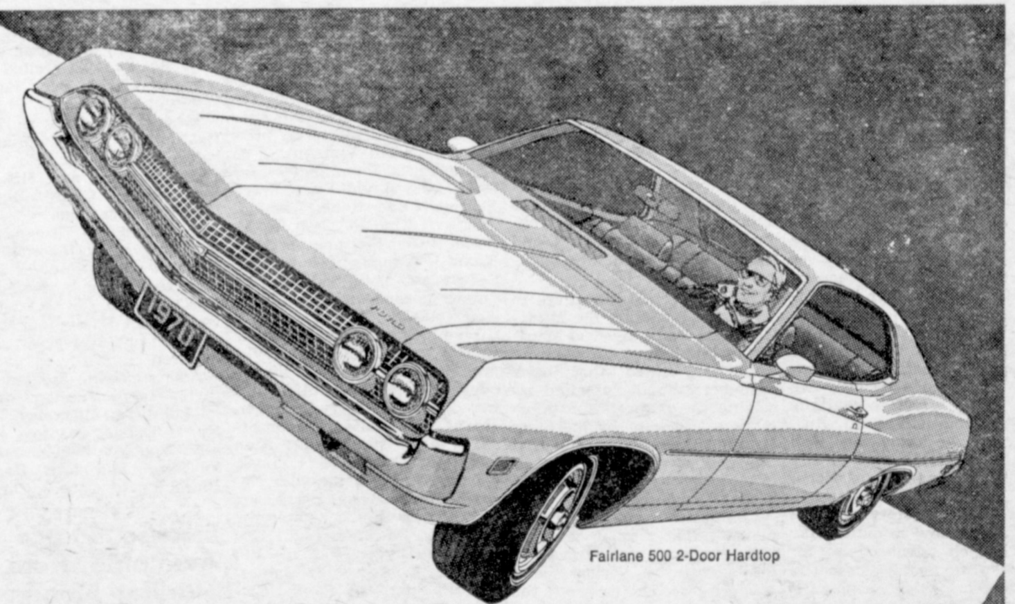
Fairlane 500 2-Door Hardtop