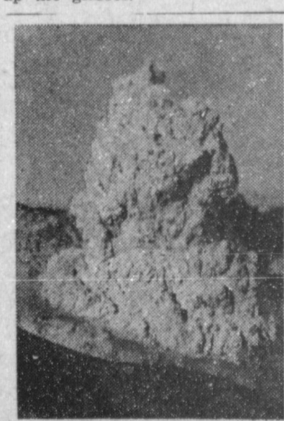
LARGEST-Atomic fury equal to the force of some 20,000 tons of TNT couldn't be contained 850 feet underground at the end of a 2,600-foot tunnel. It churned upward in this cloud of radioactive dust from the floor of the Nevada Desert in wake of the largest man-made underground explosion ever to

"Eighty kegs?" said the bar-tender, amazed. "How?" "Simple," answered the farmer. "Fill up the glasses.