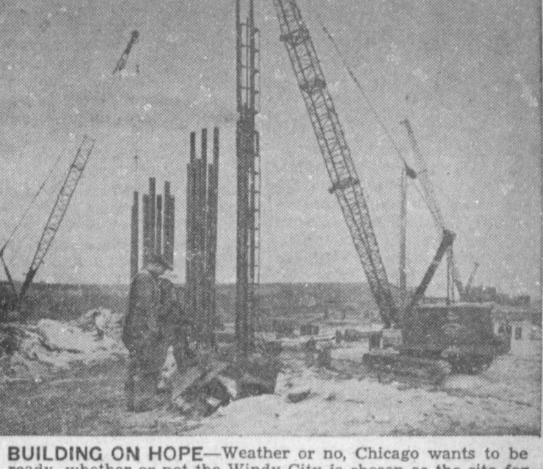
ready, whether or not the Windy City is chosen as the site for the 1960 Republican National Convention. Workmen, above, step up construction on a new lakefront convention hall.

Two simple changes would instantly rectify this imbalance of the scales of justice: (a) The an official listing of all hourlywage rates-the revised edition, from bus station, Gainesville. 17tf of course. (b) Before swinging his gavel, he should always ask the condemned man what his occupation is. Then, for exam-17tf ple: "A bricklayer, your honor."