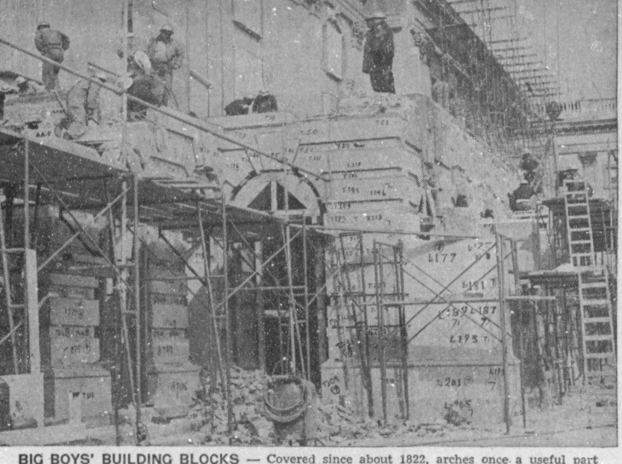
BIG BOYS' BUILDING BLOCKS - Covered since about 1822, arches once a useful part of the nation's Capitol are revealed during extension of the east front of the building. They had been hidden by a stair well. Each block of stone has been numbered according to a master plan. Arches may be set up elsewhere some time in the future, perhaps as a historical

Too bad folks don't show as much patience all the time as they do when waiting for a fish