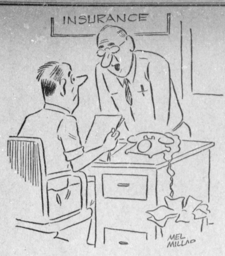
IT'S HARD TO TELL WHAT AWARD THE JURY WILL MAKE, BUT IT'S SURE TO BE SOMEWHERE BETWEEN THE EXHORBITANT AND THE RIDICULOUS."