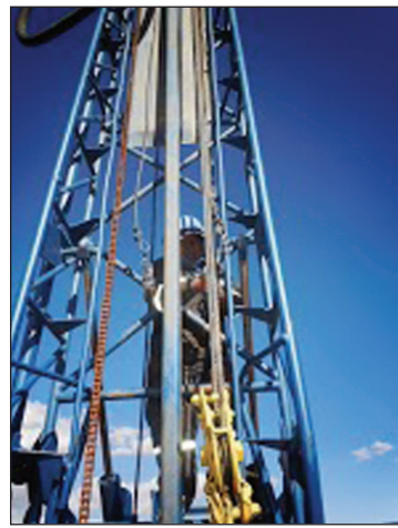
Preparing the rig for drilling.