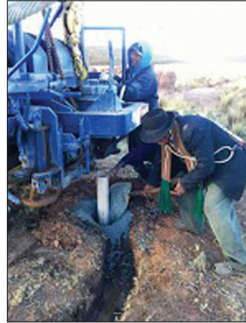
Gravel packing the shallow 40 foot well.