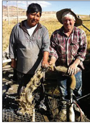
Drawing up sediment and drill mud.