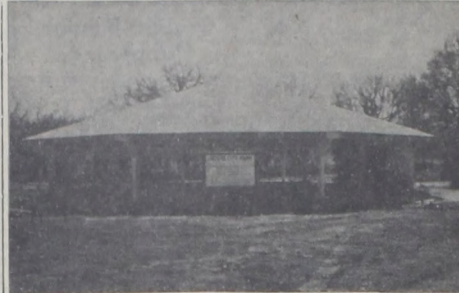
This pavilion in the city park is the inspiration behind the bull ride sponsored Thursday, Friday and Saturday nights in the Twin Pines inside arena by Muenster Jaycees. Proceeds from the show will be applied to the Jaycees debt on the project. Thursday is kids night at the bull ride. Youngsters under 12 will be admitted free if accompanied by a parent.