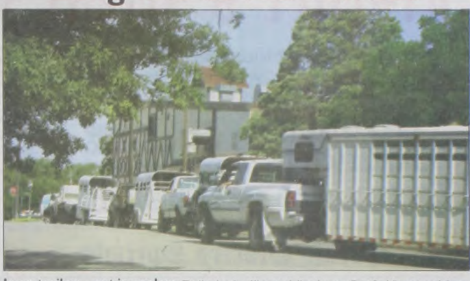
In on trailers - out in coolers. Trailer loads of livestock lined up on East 3rd Street and down Oak Tuesday morning waiting to unload at Fischer's Meat Market. Twenty-five beef were processed on that day. The norm is 18 beef and 10-12 hogs. Tuesdays and Thursdays are slaughter days at Fischer's. The local meat market is one of few in north Texas that process meat for individuals, and the Janie Hartman photo

A steel post anywhere in an electric fence can cause dead shorting.