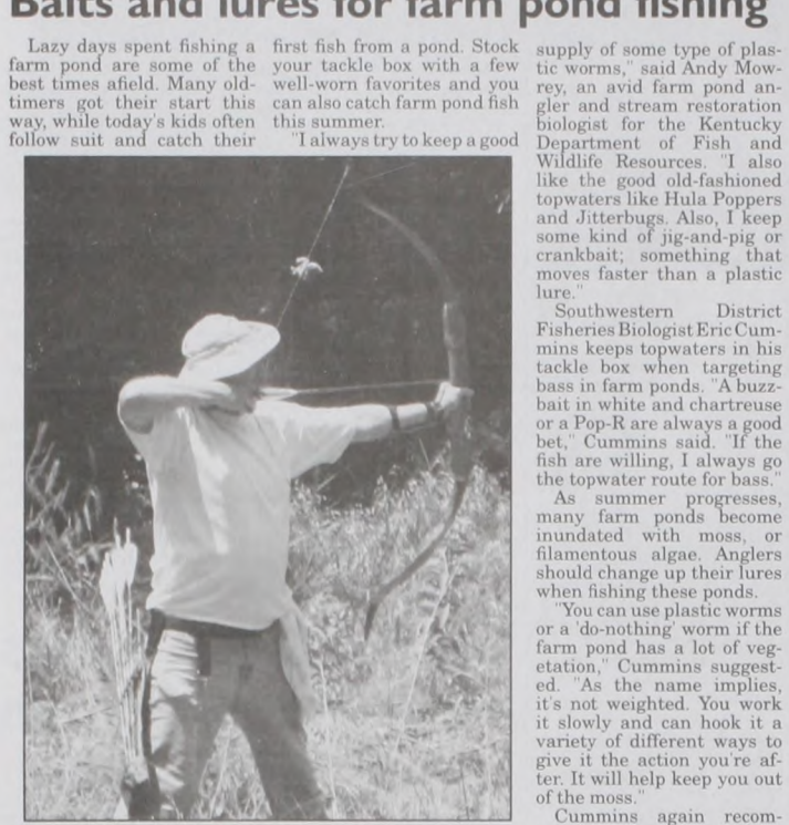
heat, chiggers, ticks, and mosquitos last Saturday, sted in the 3D Archery Shoot on Bartush land near