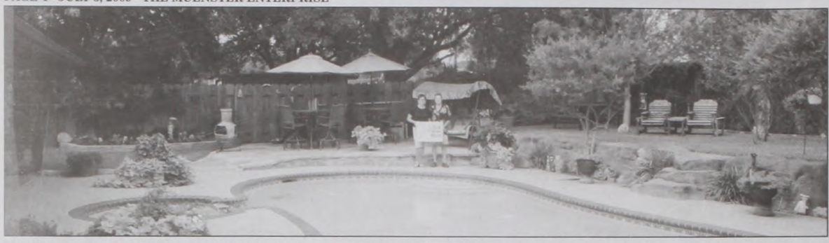
KEEP MUENSTER BEAUTIFUL YARD OF THE MONTH for June was awarded to the home of Willie and Margie Wimmer. The Wimmers' yard on North Cedar Street in Muenster features many blooming plants and trees. The front yard offers only a glimpse of the many botanical wonders that one finds in the inviting backyard. There are 18 hanging pots, 25 large containers, and more than 200 bedding plants in various beds around the yard. Hanging baskets are planted with ferns, airplane plants, purslane, Swedish ivy, moss roses, and coleus. Pots contain a mixture of plants including sweet potato vines and diamond frost. There is a raised bed herb garden filled with lavender, bronze fennel (for butterflies), thyme, rosemary, and marjoram. Sixty geranium plants brighten one flower bed. Other raised beds contain dahlias, hostas, curly leaf geranium, button chrysanthemums, coleus, ferns, such as sword and foxtail, coral bells, and trailing petunias. Trees and shrubs include Texas Mountain Laurel, forsythia, snowball, Carolina jasmine, wisteria, crepe myrtle, Bradford pear, and Chinese pistachio. There is a bed with a mix of cross vine and roses. Many little garden creature statues make their homes in the Wimmer garden. Margie enjoys collecting the statues and her variety of plants from garden nurseries everywhere she goes. To nominate a yard for Yard of the Month honors, call any member of Keep Muenster Beautiful or the Muenster Enterprise at 759-4311.