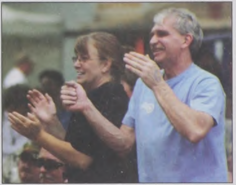
ermanfest visitors of all ages enjoyed this year's celebration last weekend at the Muenster City Park. The weather cooperated to make it ne of the more successful 'Fests in recent years.