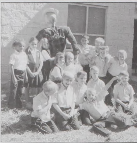
Sacred Heart students show off a scarecrow they made.

chips and salsa, and drink. Mexican cookies will be served for dessert. Cost of tickets are: adults $6.50 in advance and $7 at the door, and children under 12 years of age $3.50.