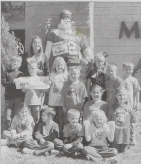
Spirited Muenster Elementary students built their favorite scarecrow for the holiday.