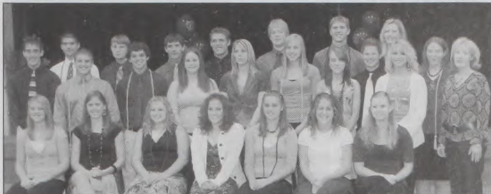
Muenster High School National Honor Society.