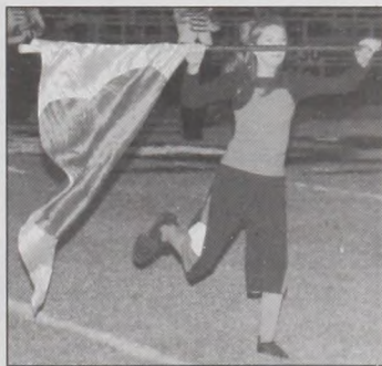
Muenster Color Guard performs