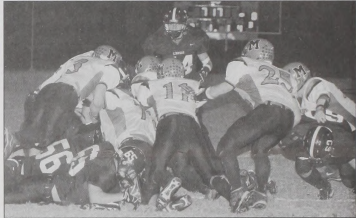
The Hornet goal line defense kept Lindsay out of the end zone three consecutive plays. The Knights scored on their 4th attempt.