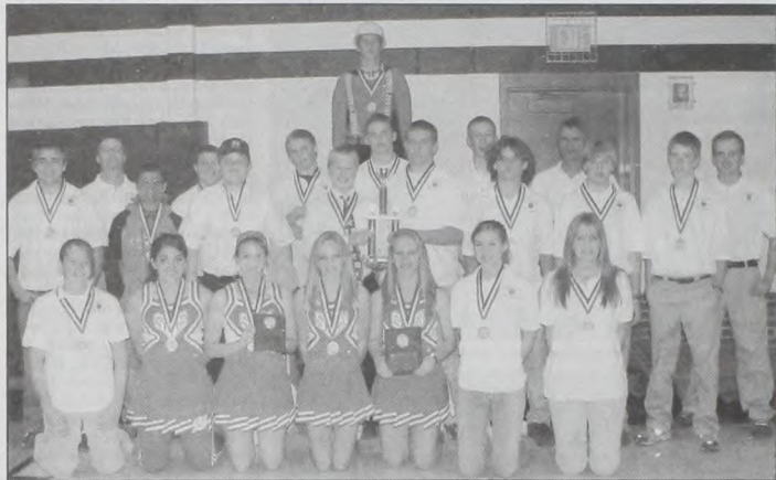
Sacred Heart Robotics Team after North Texas Boosting Engineering, Science, and Technology competition last weekend at Howe High School.