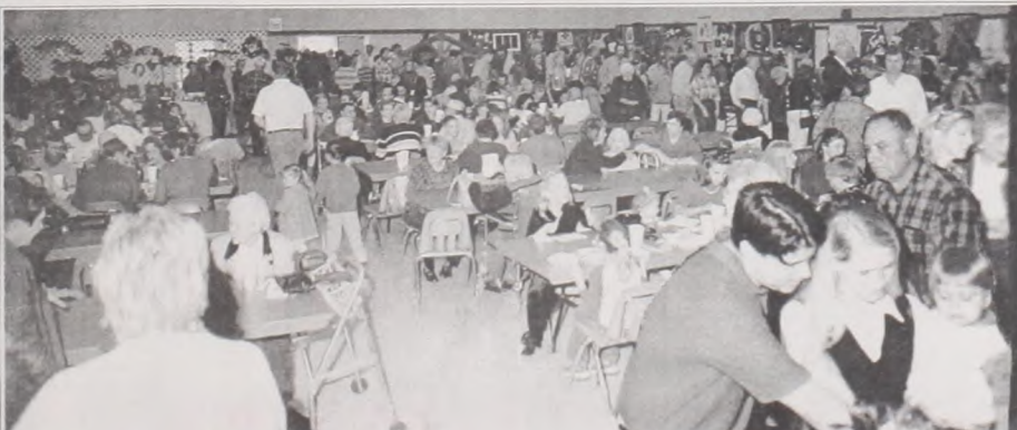
The crowd at the Sacred Heart Thanksgiving Picnic was huge and the lines of people stretched out the doors and down the sidewalks waiting their turn for the traditional Thanksgiving

In January the Auxiliary plans to begin initiating many of its ideas of various service projects to enhance the hospital. New members are welcome. All are invited to attend a meeting to see if they would like to become a part of this organization. For more information contact any of the officers.