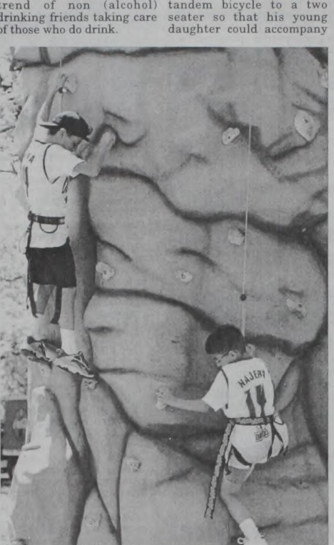
Rock climbing was a new feature at Germanfest this year, drawing much participation.