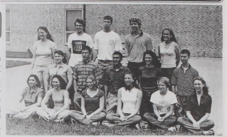
Lindsay High School, UIL Academic State Runner-up

-- Don't neglect your transmission. Costly repairs can be prevented by routine service. Courtesy of ARA Content