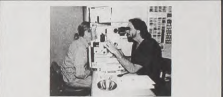
Yag Laser for in-office surgeries and cataract and lid surgeries done locally

NOTICE The annual water tower inspection will be December 10, 2002. A proper inspection requires the tank to be drained. Citizens of Muenster can expect lower water pressures on December 9, 10, and 11th. The City appreciates your patience and understanding during this time.