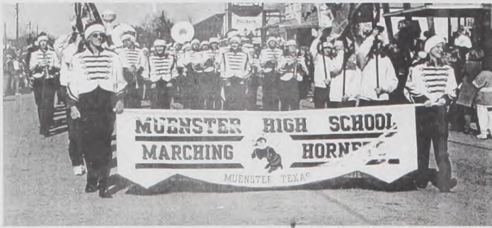
Winners in the parade for the best marching band was the Muenster Hornet Band (above) and at right, best organization category went to Cub Scouts Pack 664.