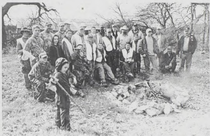
Most of the young deer hunters and their guides gather around the campfire for a photo Sunday morning before breakfast.