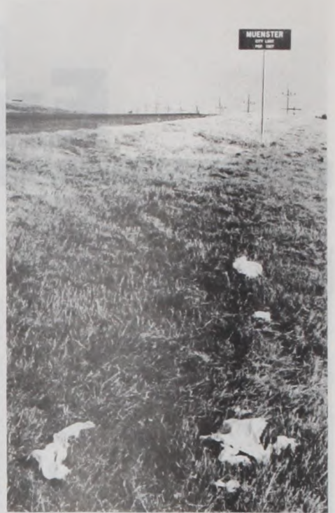
Keep Muenster beautiful? With the Highway Department's mowing along Highway 82 this past week, frash that was hidden in the tall grass has been exposed, littering the roads into town.