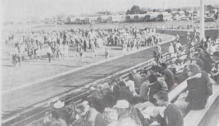
Hornet Stadium was filled with students and spectators for Thursday evenings Junior High Track Meet hosted by Sacred Heart School.

The Muenster 7th grade boys took the track district championship Monday evening with a winning 229 points. The 8th grade girls settled for second, trailing Era 191-182. Windthorst dominated the 7th grade girls, also taking the 8th grade boys championship. The other Muenster teams finished fourth and fifth. Gold medal and Muenster results are as follows: