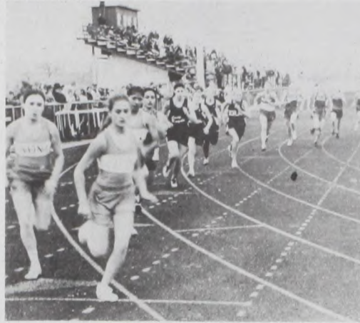
The girls 800 meter run starts at the Sacred Heart Invitational Track Meet held last Friday at Muenster High School's Hornet Stadium.