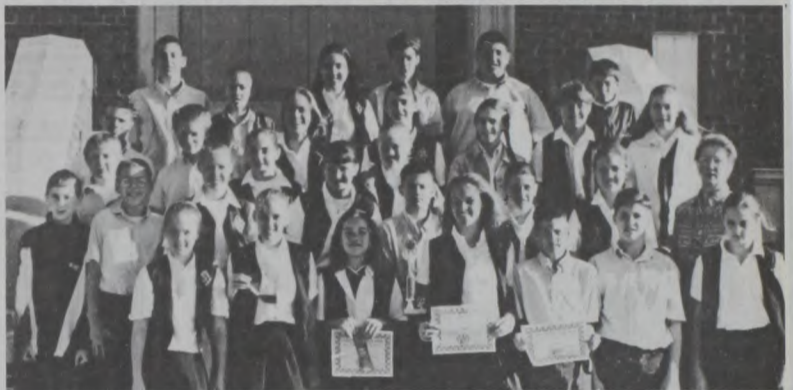
Sacred Heart Junior High Drama participants

Many of the parents came to the tournament on Saturday to support the students.