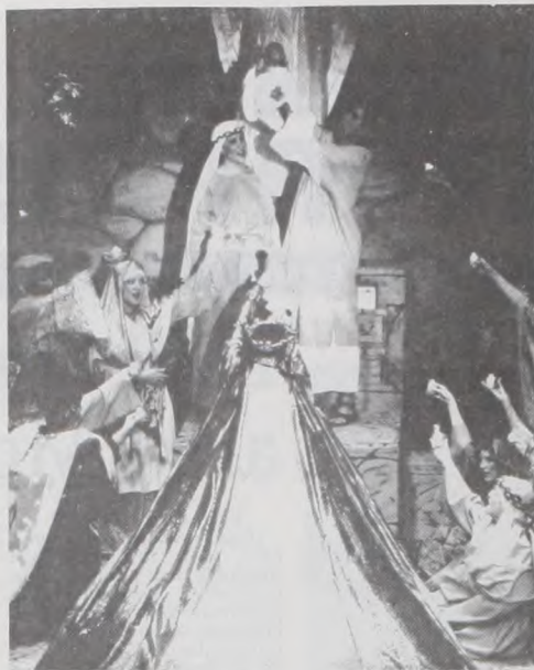
First Baptist Church, Gainesville Easter Pageant