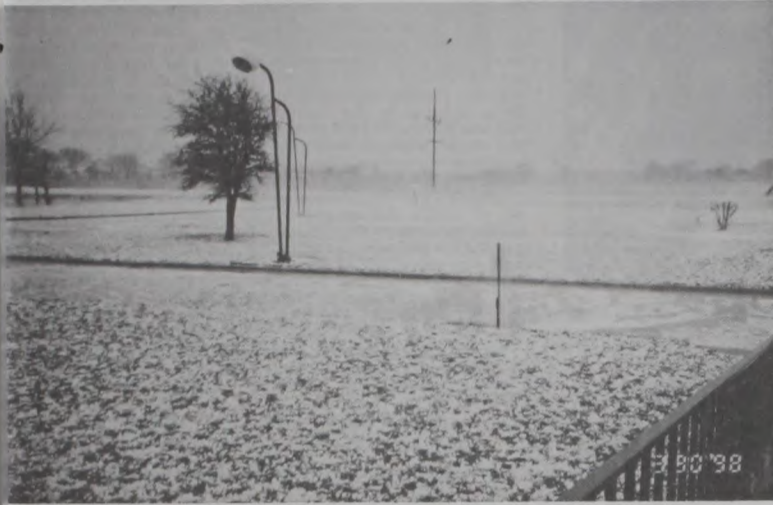
Small stones, some golf ball-size, nearly covered the ground at Cooke County Electric Co-op Monday afternoon. Blinding rain and hail stopped highway traffic, broke windows and dented cars and trucks that had to take cover.