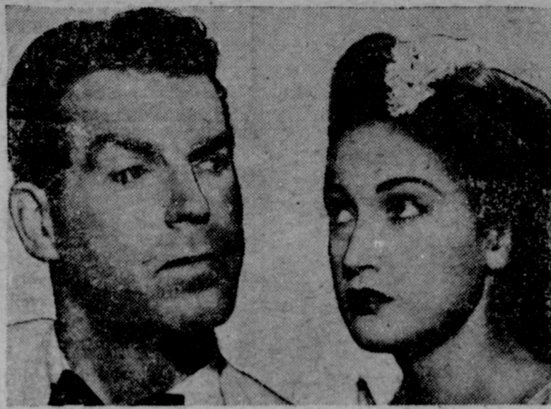
Fred MacMurray, Dorothy Lamour in a scene from "And the Angels Sing," co-starring Betty Hutton with Diana Lynn and Raymond Walburn.

One reviewer remarked: "To those who believe in God, no explanation is necessary; to those who do not, no explanation will