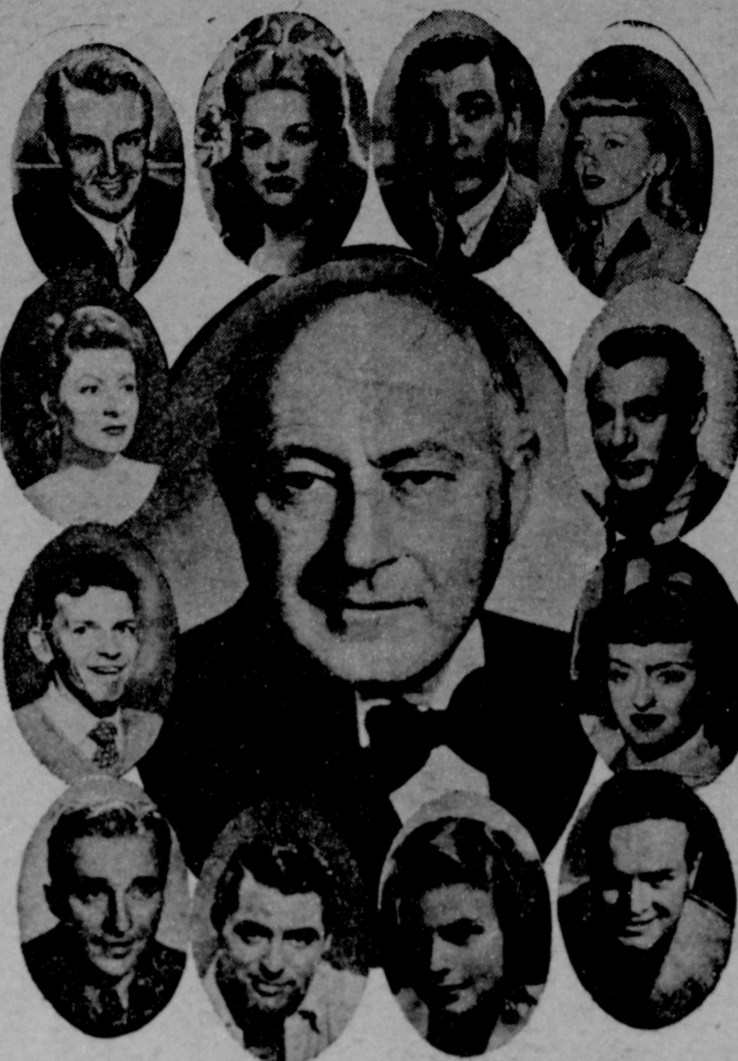
Cecil B. DeMille, shown here surrounded by some of the stars he presented on the Lux Radio Theatre last year, will bring this top ranking dramatic program back to the Columbia network on Monday evening, September 4 at 9 p.m. (EWT). Reading clockwise, starting top left: Alan Ladd, Betty Grable, Walter Pidgeon, Lana Turner, Gary Cooper, Bette Davis, Bob Hope, Ingrid Bergman, Cary Grant, Bing Crosby, Frank Sinatra and Greer Garson.

The wise man has an open mind and a closed mouth.