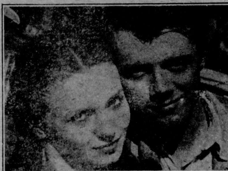
America's greatest sport, sulky racing, comes to the screen in "Home In Indiana," a story for those who love horses and racing.