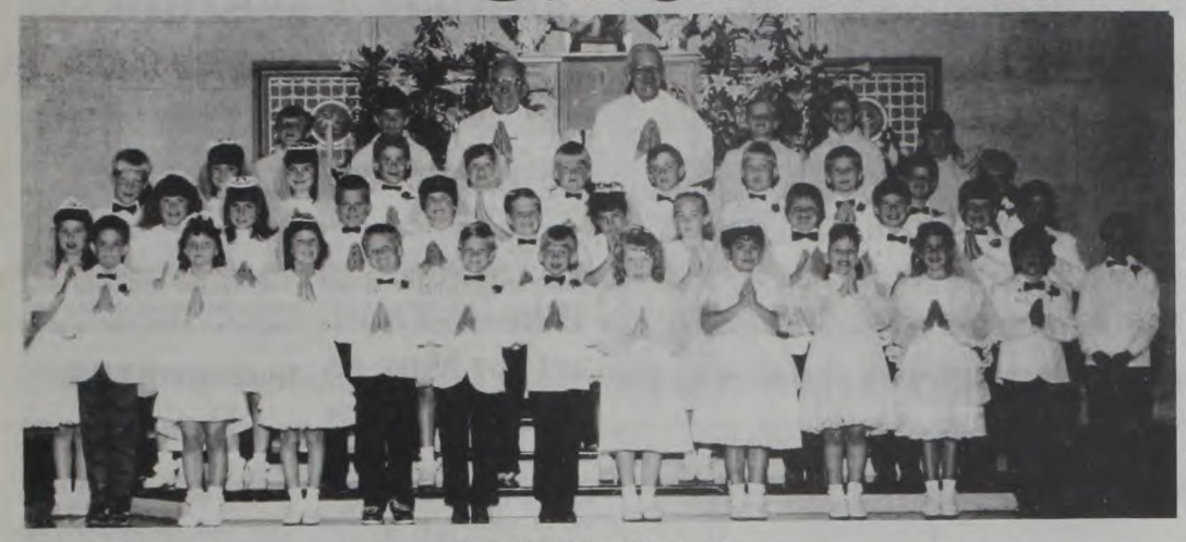
1989 FIRST COMMUNICANTS

The First Holy Communion Day for children or adults holds a most important place in family observances of treasured events. Parents and other close relatives find many ways to mark the day for special memories. Reunions are frequently included to honor the children or the adults.