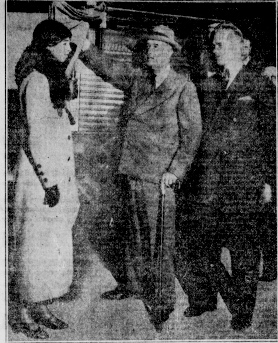
e of the island greatly Needless to say the president-elect and his family voted a straight Democratic ticket to help in one of the