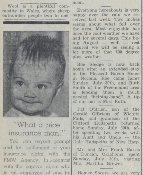
"What a nice insurance man!"

You can expect prompt and fair settlement of your insurance claim with the FMW Agency. In contrast with the 'captive' agent who is an employee of one insurance company — the 'independent' agent, such as securing settlement of your loss claims.