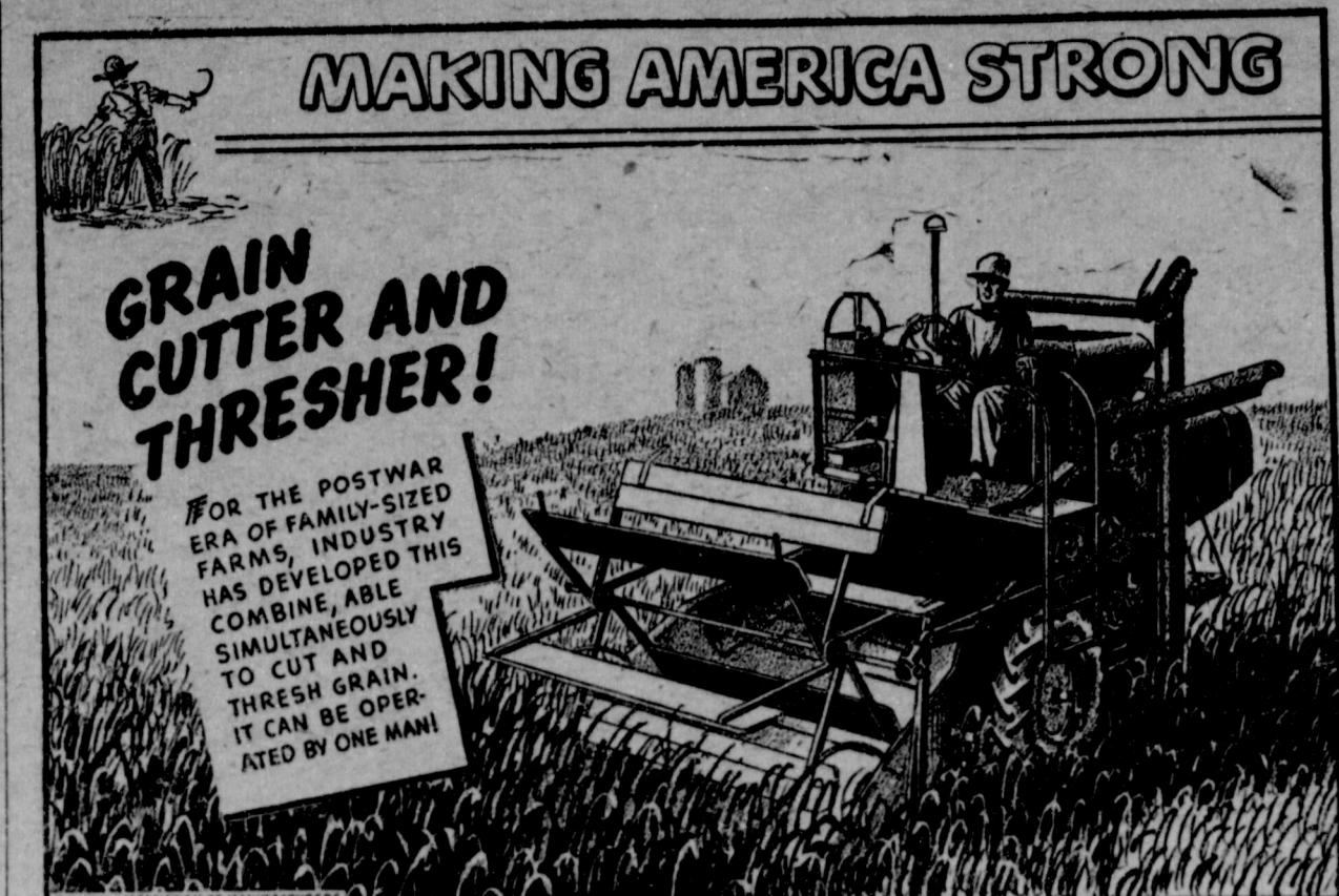
Small, self-propelled, heading di- pulled by a separate tractor, this spite of its all-out war work, in rectly into the grain instead of being | machine is proof of the fact that in | dustry plans for peacetime farms.