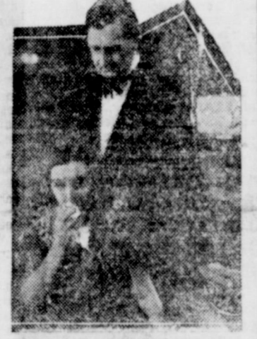
THEY JUST HAD TO GET MARRIED