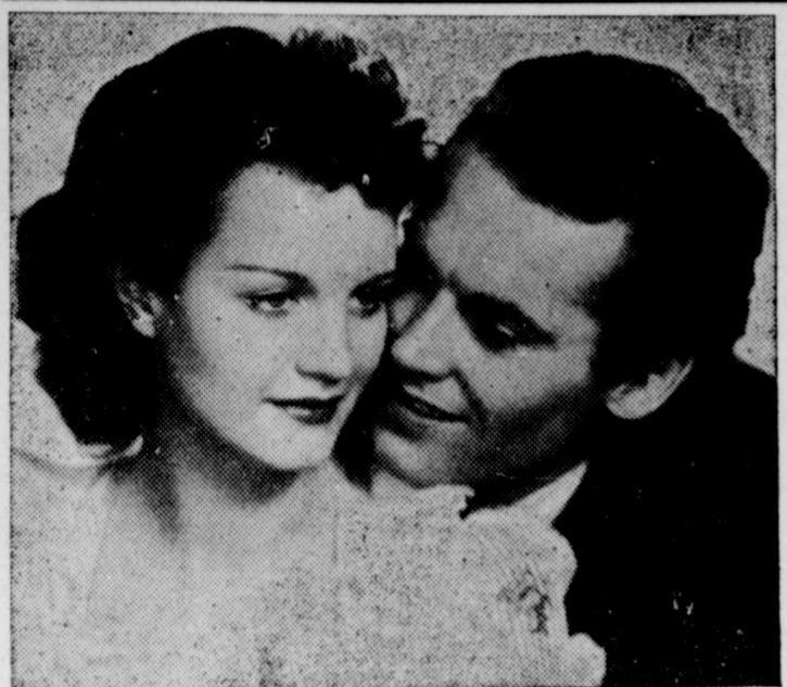
In the tenderest, most eloquent love story the screen has ever presented, Fox's picturization of "Way Down East", ROCHELLE HUDSON and HENRY FONDA share starring honors. Their love, in this great American melodrama, triumphs over deceit, moral bigotry and scorn.

In screening "Way Down East," Fox film has not only brought to the talking pictures the drama which has had an undisputed hold on America's heart for more than half a century, but has also photographed a lustrous, glowing and enduring narrative of New England life.