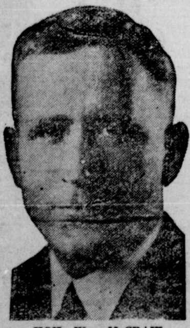
HON. Wm. McCRAW Attorney General