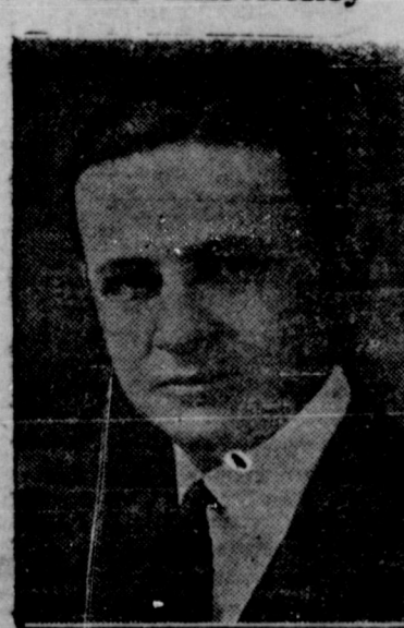
HON. JAMES V. ALLRED