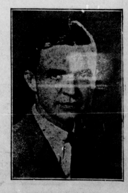
HON. EUGENE WORLEY Representative