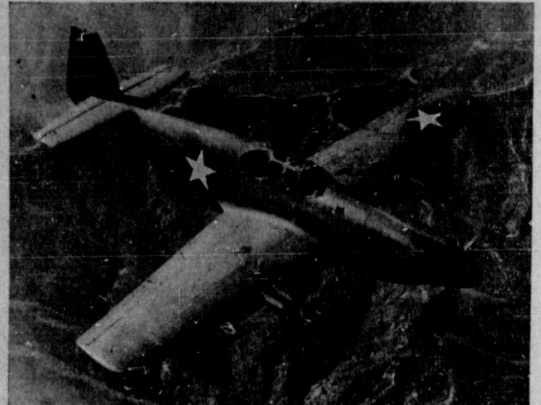
Four 20-millimeter cannon have made the North Anterican P-51 Mustang fighters, similar to the one shown above, the scourge of Axis transportation. On land and sea, Mustangs have won the nickname of "train busters" for their record in destroying scores of enemy locomotives in occupied Europe.

matter is entirely in the hands of school age, however, vaccination