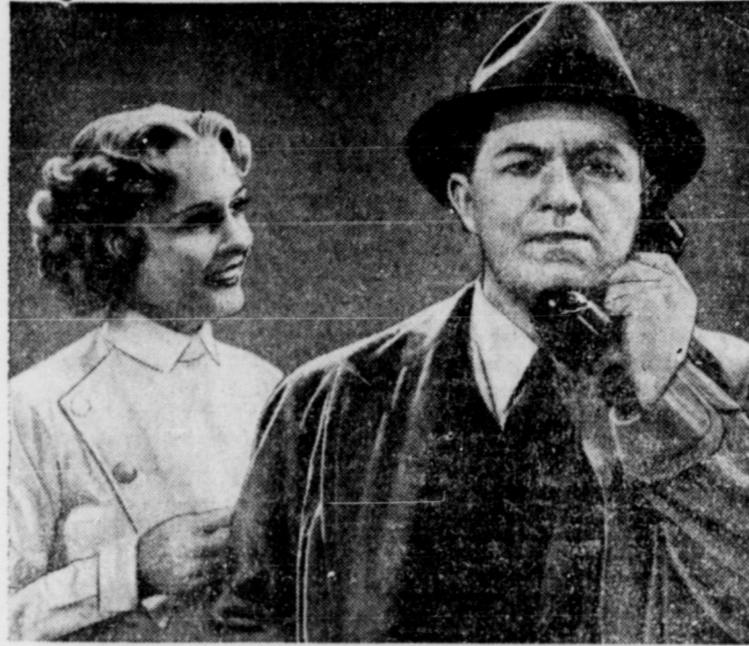
Madge Evans and Stuart Erwin in "Exclusive Story"