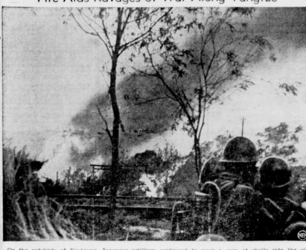
while flames already licked at the suburbs of the doomed town. This remarkable picture was made under fire by a Japanese photographer just behind the advancing front line of the Japanese troops.