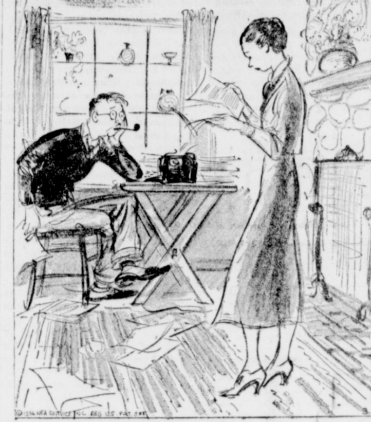
"That editor doesn't know what he wants. Says that yarn's no good, and it's almost exactly the same story I sold him last year."

sion, men now constitute nearly lantic Monthlies, Scribners and lantic Monthlies, Scribners and World's Works put on top of the high schools, one of every two new lantic Monthlies, Scribners and World's Works put on top of the All-Stories and True Detective. Be teachers appointed is a man. seein you . . .