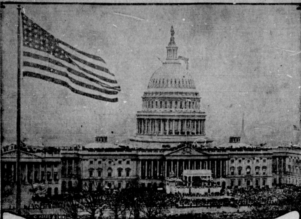
This view of the capitol in Washington during the Hoover and Curtis Inaugural ceremonies was taken from the top of the Library of Congress.