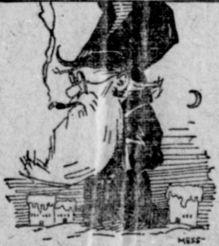
BY GOSH! THEY ARE NOW LIGHTING THEIR CIGARETTES WITH DOLLAR BILLS IN FLORIDA