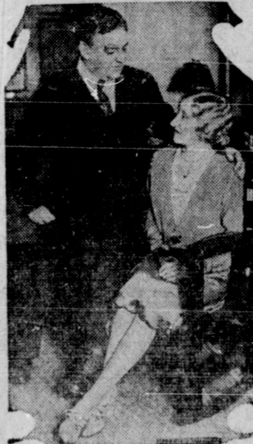
Representative Fiorello H. La Guardia of New York recently was married to his secretary, Marie Fisher. The photograph shows Mr. and Mrs. La Guardia shortly after the ceremonies.