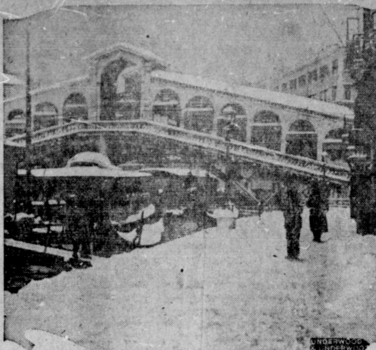
This view in Venice, near the famous Rialto bridge, was taken after a recent heavy snowfall which compelled travelers to give up canal transportation for the time and go afoot.