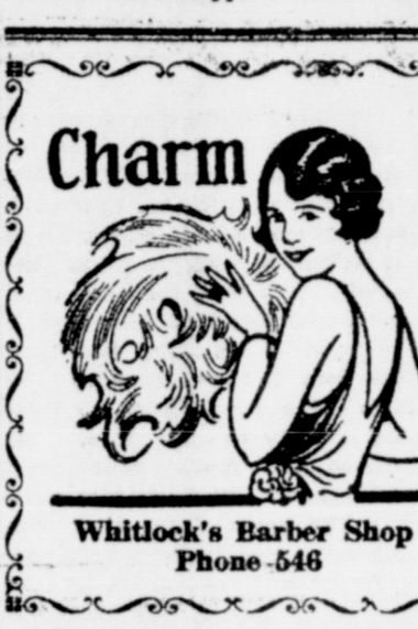
Whitlock's Barber Shop Phone-546

Charm HOW TO RETAIN CHARM— You need not be typical of Venus de Mile to be attractive and charming. Regardless of what Nature has done for you there is opportunity to make the best of features, complexion and hair. If you will visit our Beauty Parlors regularly we will increase and make permanent your charm and attractiveness. Phone now for an appointment.