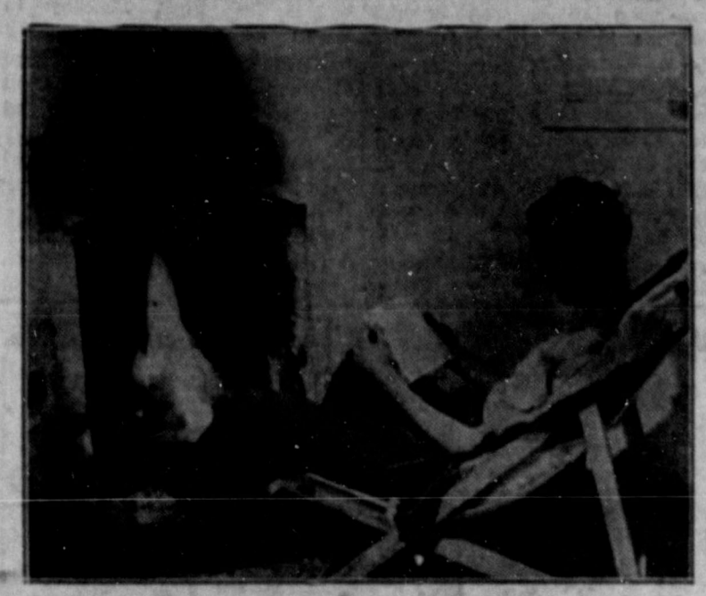
Released by U. S. War Department, Bureau of Public Relations. ALL THE COMFORTS OF HOME-Nearly all the villas have open fireplaces which provide cheery surroundings for the airmen during long winter evenings. Bomb packing cases furnish material for bureaus, chests, stands and chairs. Used bomb racks are foot-