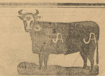
Range Palo Duro Canon; also American or Durham cattle brande!