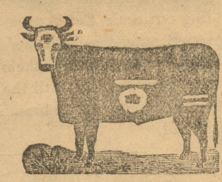
WILSON BROS. & THOMAS.

Also Cattle in following Brands: S on shoulder, o side, S thigh, marked over slope and under bit right ingle bob left. O B crop and underslope each ear. 11 X swallow fork right crop the left. - on shoulder and A 4 on side, under slope and upper