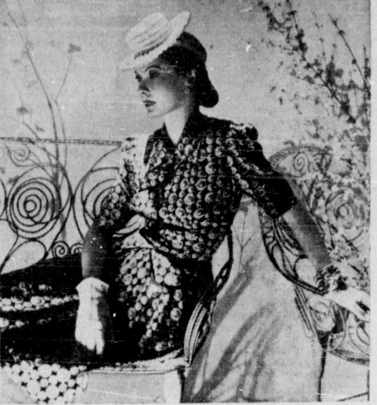
SUMMER i., town, not easy to take, but this daisy (literally) figured dress and jacket of green rayon jersey is good defense against the heat. A feature in the May Harper's Bazaar, the "casual life" issue.