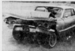
WAYNE LEGG WAS KILLED IN THIS CAR. TWO OTHER BOYS WERE SERIOUSLY HURT.