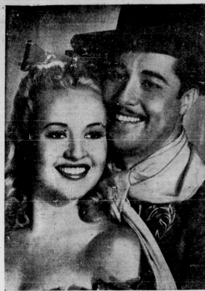
LOVE finds Don Ameche and Betty Grable in "Down Argentine Way," 20th Century-Fox musical extravaganza in Technicolor, coming to the Pastime Theatre, at the Saturday night Prevue, also Sunday and Monday.