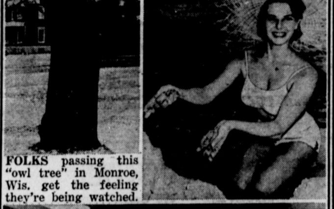
FOLKS passing this "owl tree" in Monroe, Wis. got the feeling they're being watched.