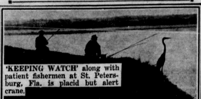
'KEEPING WATCH' along with patient fishermen at St. Petersburg, Fla. is placid but alert crane.