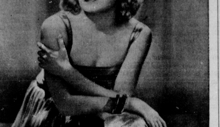
Miriam Hopkins in "LADY WITH RED HAIR"