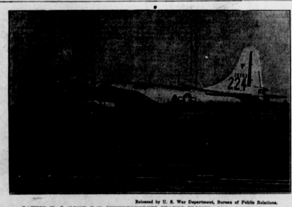
LATEST U. S. ARMY B-29 SUPERFORTRESS STARTS FLIGHT-Compare this giant bomber with the fragile little "flying machine" of 1909. The B-29 has a wing span of 141 feet, 3 inchesmore than 106 feet wider than the first Army plane-weighs 135,000 pounds, and is driven by four 18-cylinder engines of 2,200 horsepower each. Its speed is rated at more than 300 miles per hour. It carries a bomb load up to 10 tons or more beside an armament of 10 to 12 50-caliber guns. Its wing spread is greater than the length of the runway for the take-off of the first Army plane of 1909.

The people of Lelia Lake, and tery with Blackburn-Shaw-Bun- of the other communities involvtin Funeral Home in charge of ed are cordially invited to attend the services.