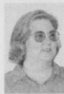
around town by gail shelton Clarendon • 874-9186

Some of our students will have a week off before plunging into