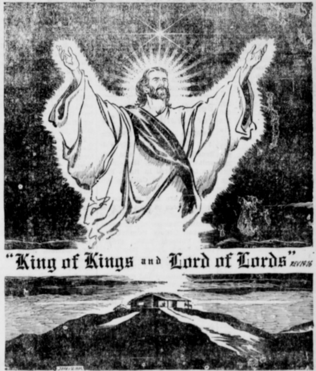
"King of Kings and Lord of Lords" REV 19:16