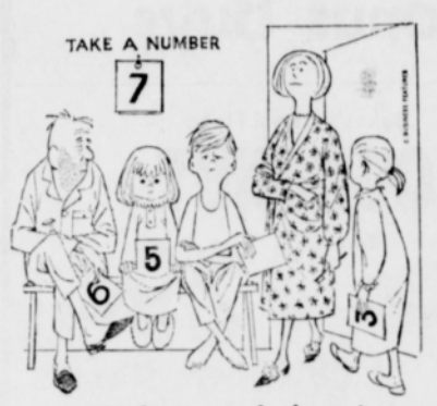
Need an extra bathroom? See us for a home improvement loan.