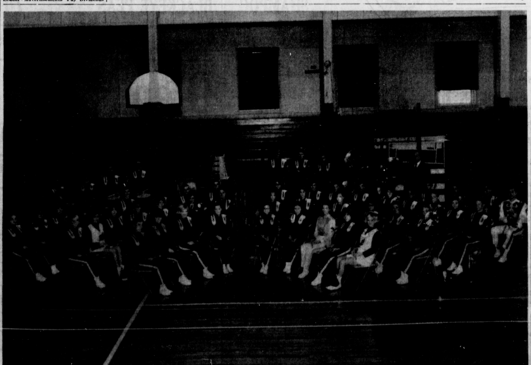
The Clarendon High School Band took a first Division rating in both Concert and Sightreading at the U. I. L. Regional Concert-Sightreading contest held at Panhandle April 23rd. This was the first time since 1934 that the band has received a first Division rating in both.