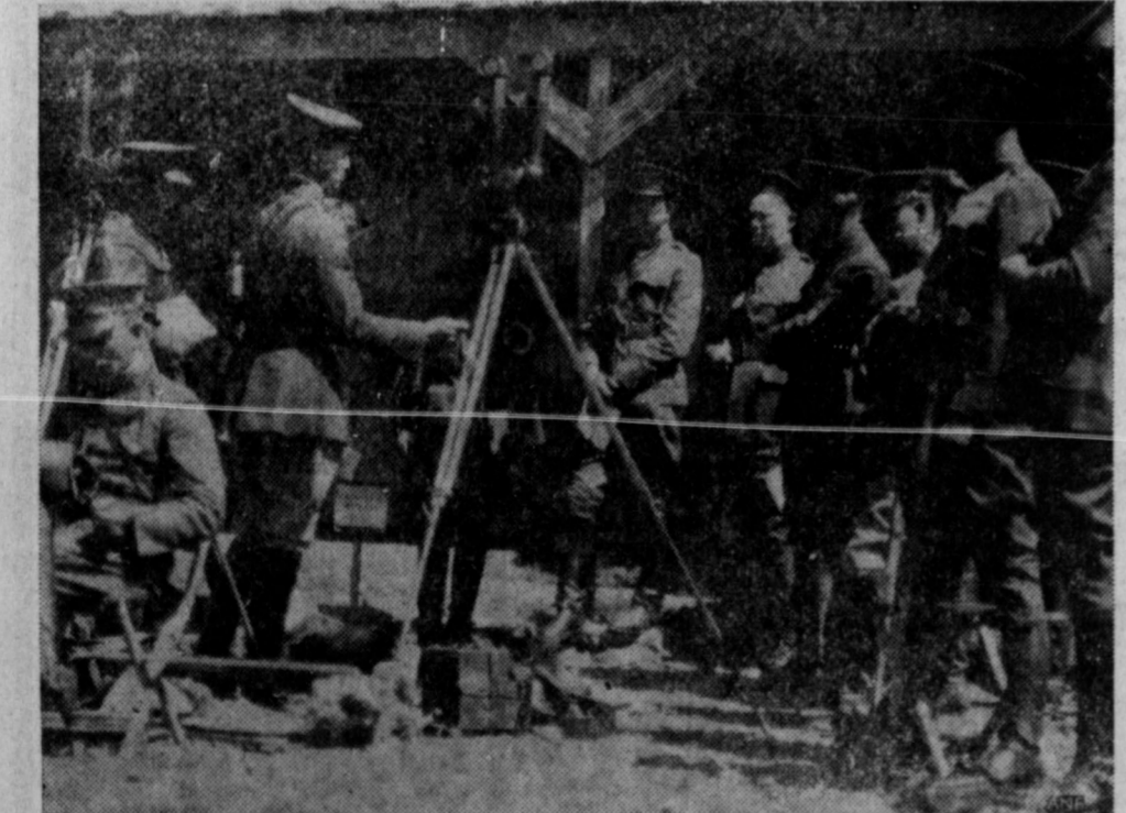
STUDENT ARTILLERY OFFICERS

A critique is held for student officers upon completion of an artillery problem at Fort Sill in 1930. The change from a cavalry to an artillery post began in 1902. 33 years after Camp Wichita was staked out. Nine years later the War Department ordered a School of Fire for Field Artillery established at Fort Sill. On Dec. 13, 1930, Secretary of War Patrick J. Hurley designated Fort Sill as the permanent home of the field artillery.