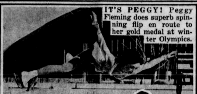
IT'S PEGGY! Peggy Fleming does superb spinning flip en route to her gold medal at winter Olympics.