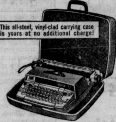
This all-steel, vinyl-clad carrying case is yours at no additional charge!

Here's a perfect example of Smith-Corona's master craftsmanship! A complete electric typewriter built into a handsome portable. So many conveniences: inexpensive Changeable Type™ for languages, science and math, Page Gage™, jeweled main bearing, automatic electric repeat actions... even electric shift and spacing. It has everything... plus a 12" carriage for king-size jobs.