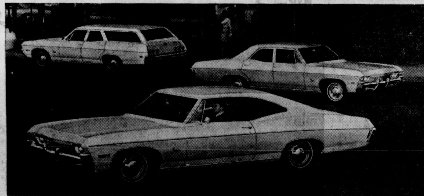
Impala Sport Coupe (foreground), 4-Door Sedan, Station Wagon