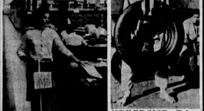
ELECTRIC scooter speeds office page girls around 20-acre plant of Honeywell Inc.'s Industrial Division.