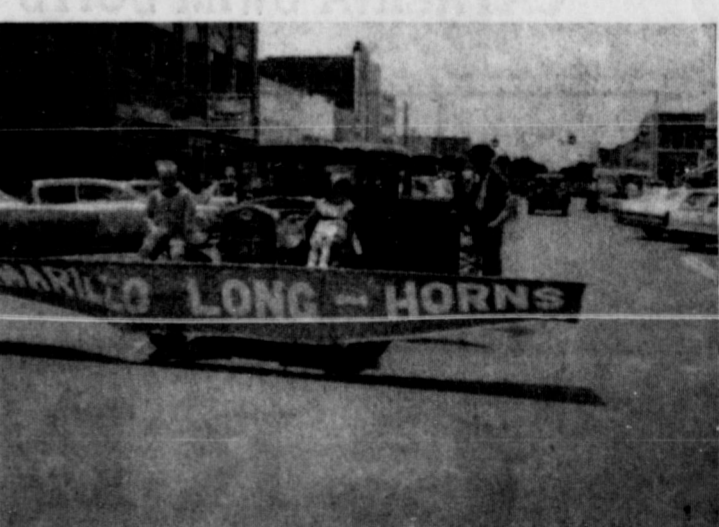
Photos of Annual July 4th Celebration Parade—left to right, Colors lead parade; Boy Scout float 2nd place winner; Pampa Riding Club 1st in Riding Club Division; Amarillo Long-Horns 1st place winner in Model A Division.