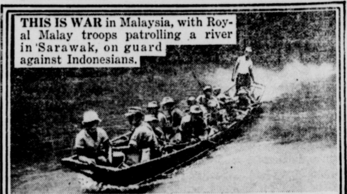
THIS IS WAR in Malaysia, with Royal Malay troops patrolling a river in Sarawak, on guard against Indonesians.