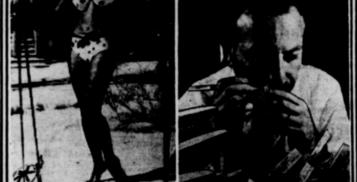
GEM DANDY: Stylish diamond watches are checked at Bulova, whose market experts say 13 million Americans will buy or receive new watches this Christmas.