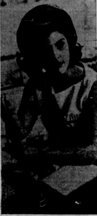
LUCI BAINES JOHNSON, the President's younger daughter, at her desk in the White House, as she began her duties as honorary chairman of the Teen Age Program of the 1965 March of Dimes.

Luci Baines Johnson, America's most famous teenager, will be honorary chairman of the 1965 March of Dimes Teen Age Program against birth defects. Luci, who has some very strong opinions about young people and their place in society, is leading a task force of thousands of young people in the fight against birth defects.