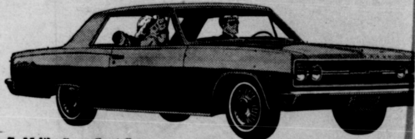
'65 Chevelle Malibu Super Sport Coupe

'65 Chevrolet Impala It's longer, lower, wider—with comforts that'll have expensive cars feeling a bit envious.