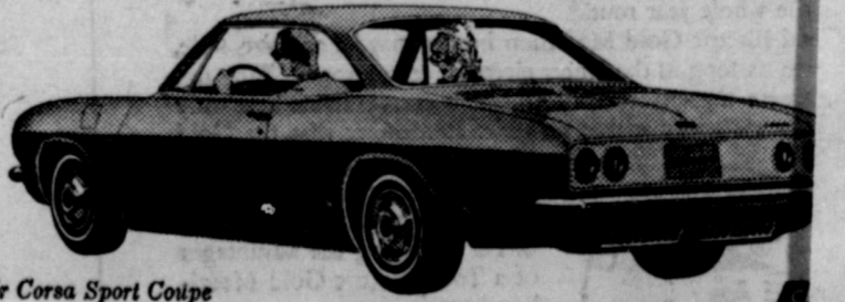
New Corvair Corsa Sport Coupe

'65 Chevy II Nova It's the liveliest, handsomest thing that ever hit the road. V8's available with up to 300 hp.