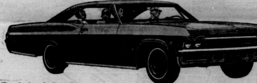
'65 Chevrolet Impala Sport Coupe

So place your order now for delivery on the beautiful new kind of '65 Chevrolet that's right for you!