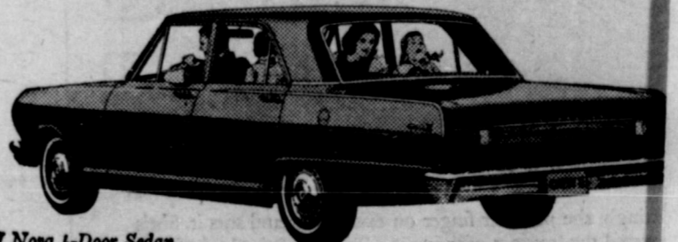
'65 Chevy II Nova 4-Door Sedan

'65 Chevelle Malibu It's smoother, quieter—with V8's available that cut to 350 hp strong. That's right—350.