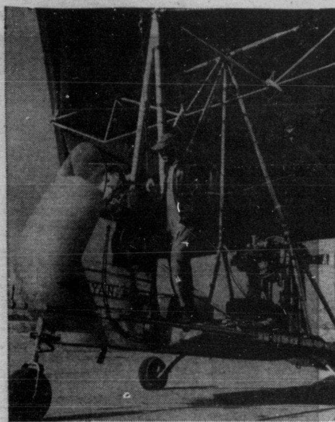
SUCCESSFUL TESTING —The XV-8A FLEEP has completed flights under a two month research test program at Yuma, Arizona Proving Ground. Powered by a 210 horsepower Continental pusher type engine, the FLEEP can operate from almost any unimproved site that can accommodate normal helicopter operations. Ryan Aeronautical Company is the developer of the FLEEP.