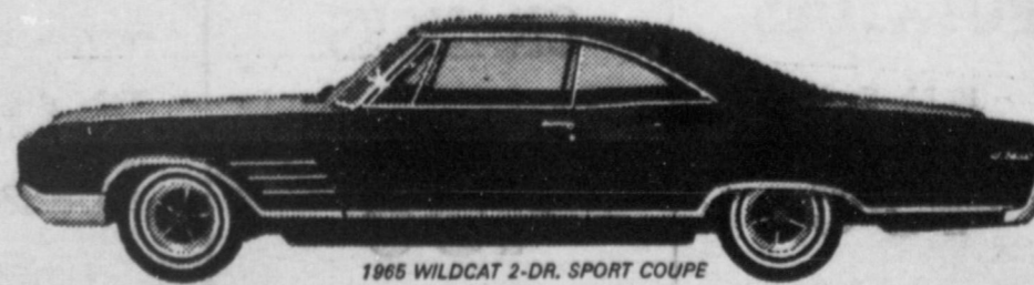
1965 WILDCAT 2-DR. SPORT COUPE

Good news for patient people. The '65 Buicks are in production again. And lots of new Buicks are on their way to us. Help us send your favorite on its way to you. Come in and order the Buick you want.