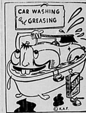
"Come on in, the washin's fine."

Car washing and lubrication are specialized services with us. We have the right lubricant and we KNOW where it should go. When we wash your car we CLEAN IT inside and out.