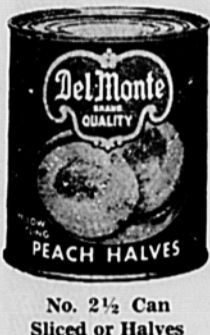
No. 2 1/2 Can Sliced or Halves

Tomato Juice DEL MONTE 46 oz can, 3 for 89c