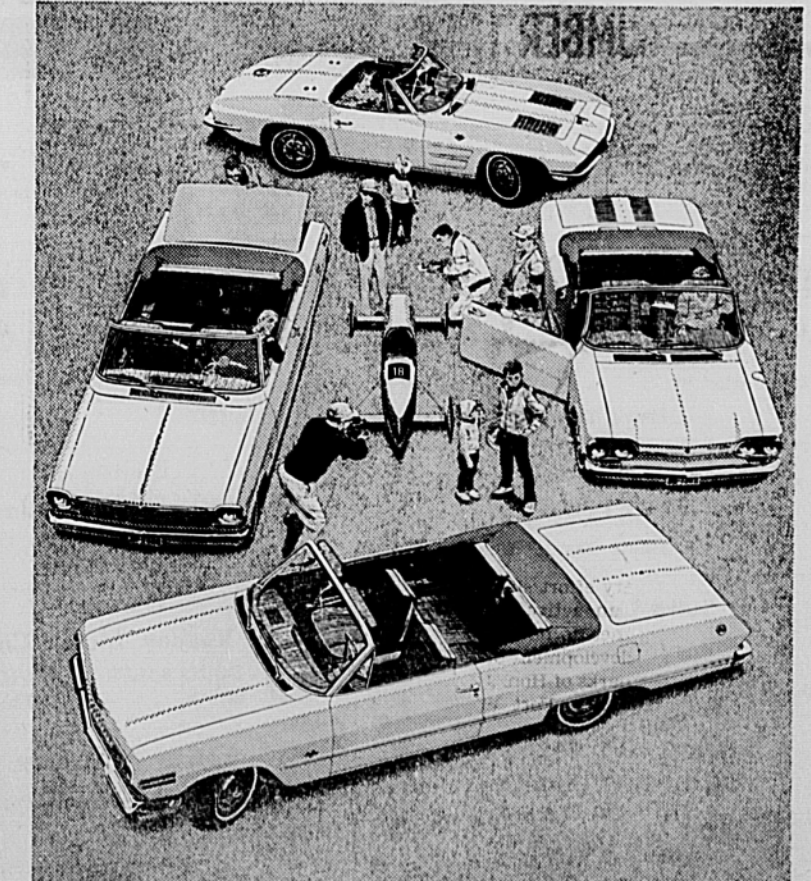
Models shown clockwise: Corrette Sting Ray Convertible, Corrair Monza Spyder-Convertible, Cherrolet Impala Super Sport Convertible, Chery II Nova 400 Super Sport Convertible. Center: Soap Box Derby Racer, built by All-American boys.

Sport zing applies to the Corvair Monza Spyder, very breezy with its air-cooled 150-horsepower rear-mounted engine, and 4-speed shift*. Ditto for the new Corvette Sting Ray, a magnificent thoroughbred among pure-blood sports cars with not a single-sacrifice in comfort. Both Spyder and Sting Ray come in coupe or convertible styles. All Chevrolet Super Sports are like spring days—you've got to get out in them to savor them. So catch yourself a passing zephyr catch yourself a passing zephyr and waft on down to your Chevrolet showroom. *Optional at ext