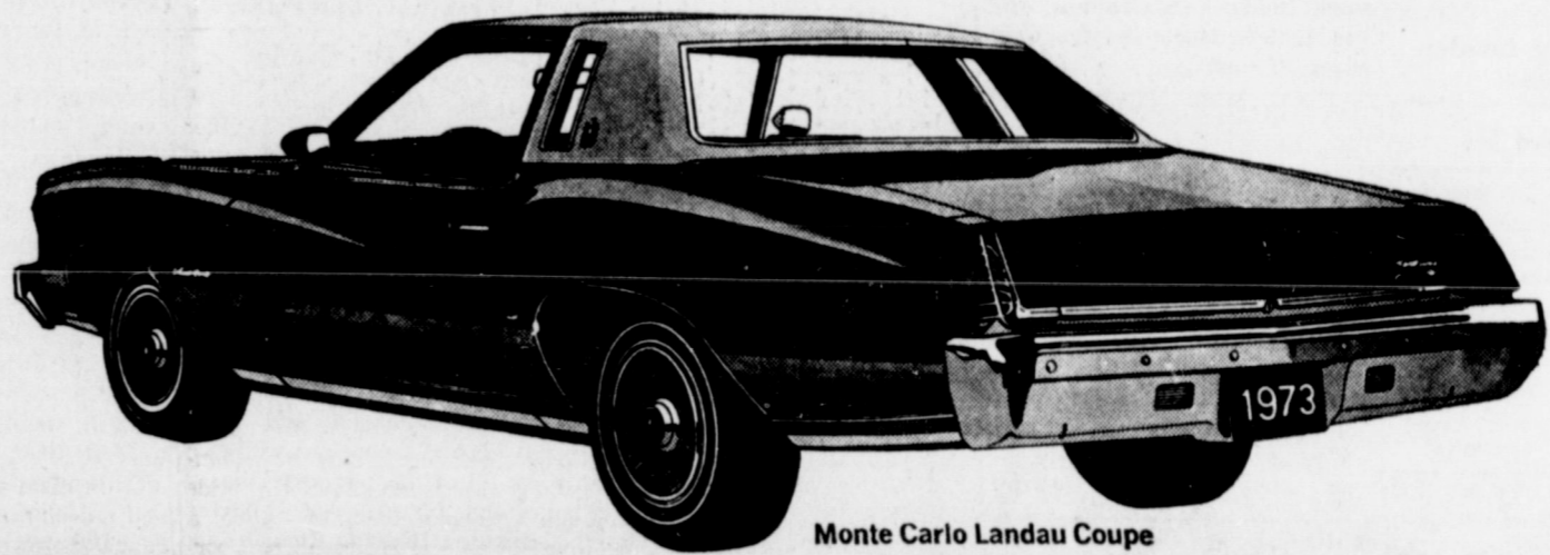
Monte Carlo Landau Coupe