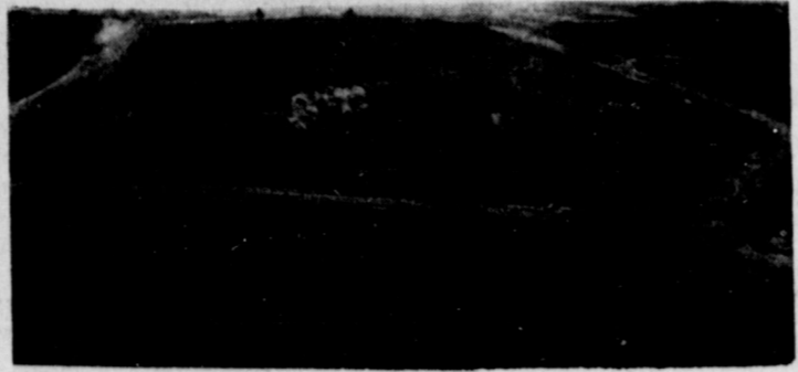
Shown is a portion of the new Greenbelt Moto-Cross track south of Greenbelt Lake and off Highway 287 west of Clarendon. The track is a popular one with riders in the area.