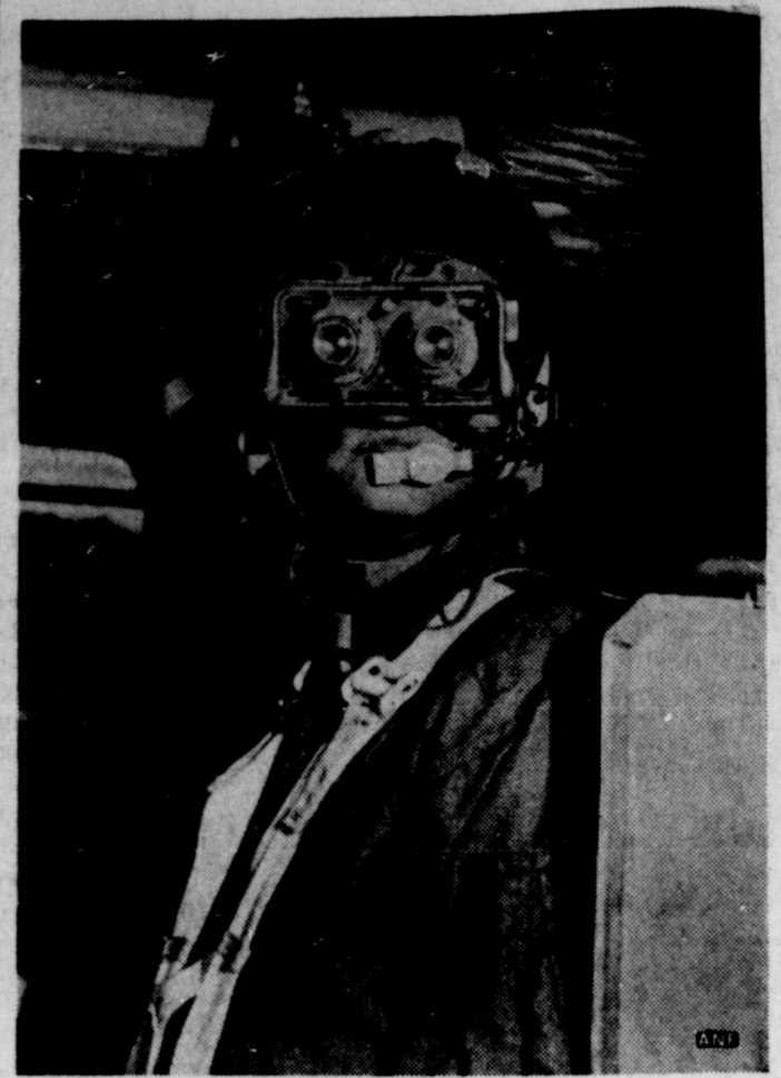
HERE'S LOOKIN' AT YOU—An Army aviator models the new night vision goggles developed by the U.S. Army Land Warfare Laboratory at Aberdeen, Md. The goggles will permit helicopter pilots to operate in tactical situations during darkness or adverse weather. Pilots can be trained to use the goggles in four hours: one hour of classroom training, one hour of daylight flight and two hours of night flight.