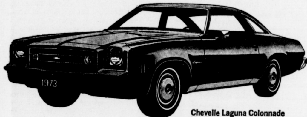
Chevelle Laguna Colonnade Hardtop Coupe