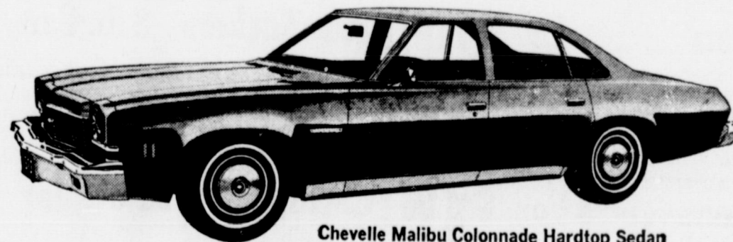
Chevelle Malibu Colonnade Hardtop Sedan