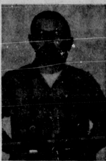
SCIENCE FAIR SCD CONTEST TROPHIES